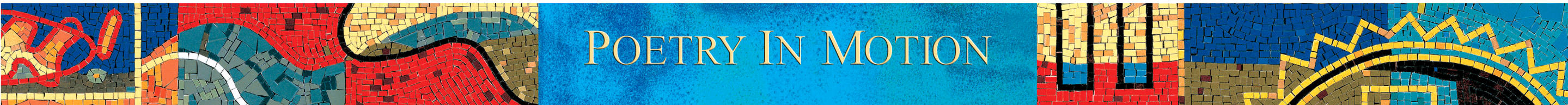
Mosaic artwork from 149th Street subway station by José Ortega for MTA Arts for Transit